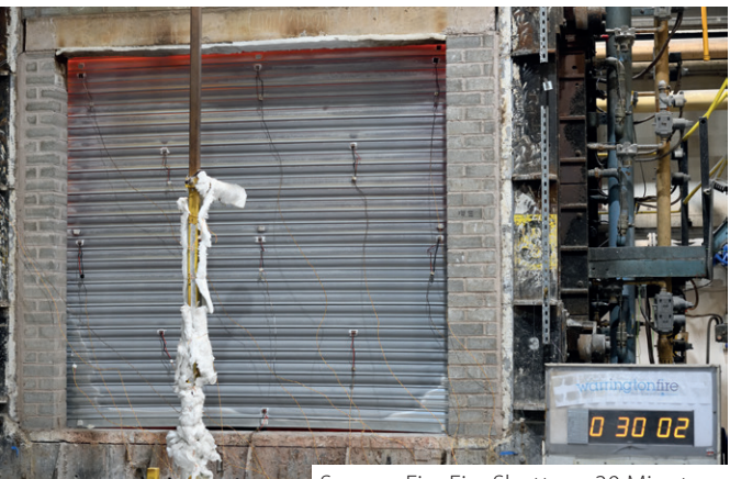
SeceuroFire Fire Shutter – 30 Minutes

The SeceuroFire Fire Shutters were tested and assessed by Warringtonfire. The product is fitted on the furnace side replicating the most severe condition and the temperature of the furnace is increased to 1200°C at a rate defined by the product standards.